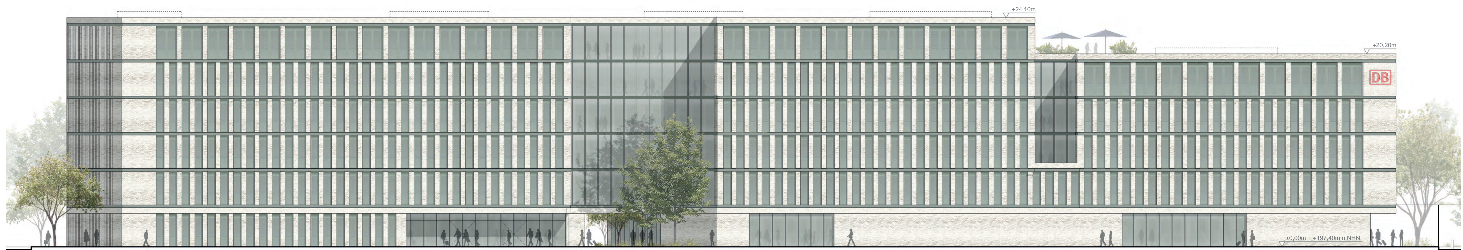
Planstr. E Eingang Bahngasse Planstr. D Planstr. C