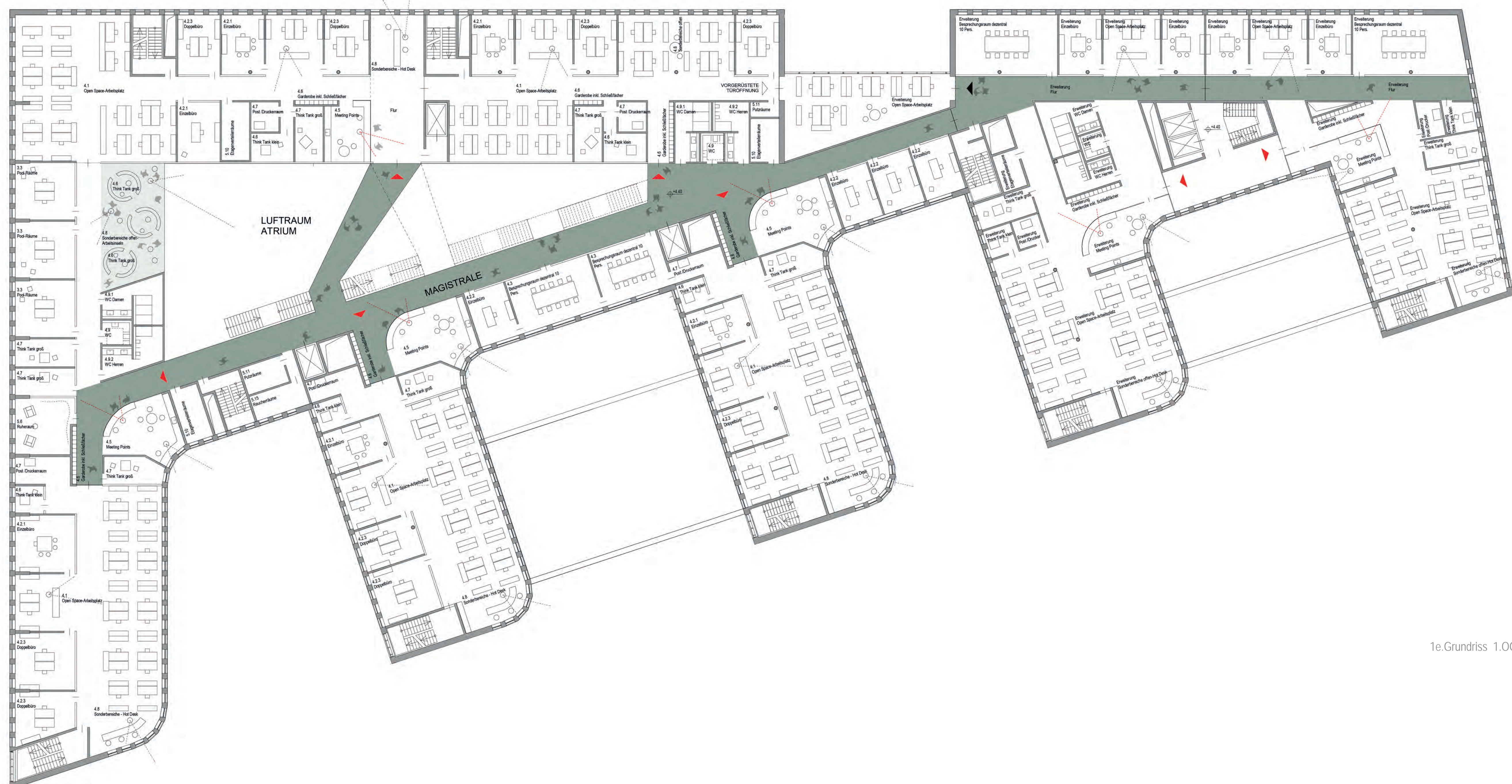
1e.Grundriss 1.OG 1:200