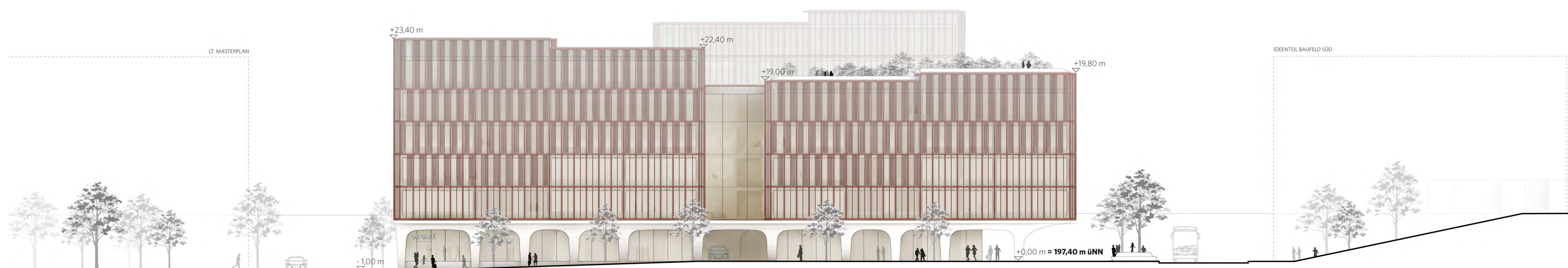
ANSICHT WEST | 1_200